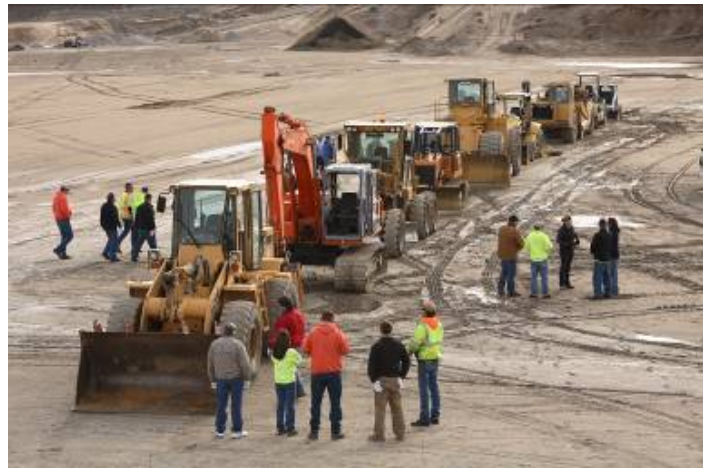
Heavy equipment training was very popular

A record-breaking 965 people attended (a 27% increase over last year) from six states, representing 231 companies, and filling 1913 seats. Forty-seven classes were offered including one in Spanish, three 2-day classes, and two 3-day classes, and 26 of these were taught by Snake River Chapter members! The opening session included OSHA Region 10