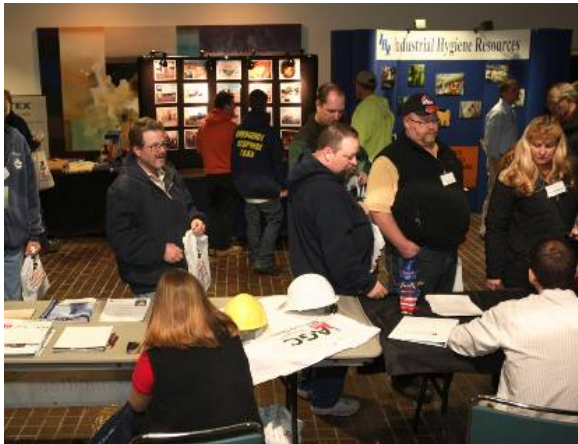
38 vendors participated

10 office of OSHA; Idaho AGC; Idaho Division of Professional Technical Education; University of Washington; and Idaho's OSHA Consultation Program at Boise State University.